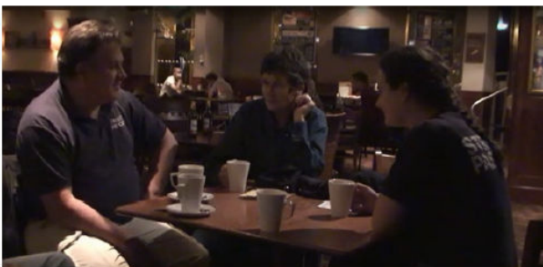
Coffee break at Wetherspoons—The Six Templars, Hertford. We thank them for their generous support.

We record details of our activity and during the calendar year 2011, we clocked up 1044 volunteer hours, on 43.5 patrol on the streets assuming an average of 4 Street Pastors per patrol. On occasions we go out in teams of 3 ... hence the odd number. In addition, we pick up bottles (glass and plastic) metal cans and on one occasion a broken umbrella was left in a dangerous place. Flip Flops are handed out to those who cannot cope with their high heel shoes any longer, along with water, sweets and space blankets to those who are cold.